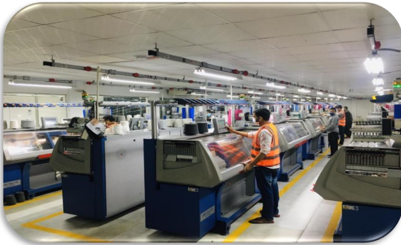
Stoll Flat Knitting Machines CMS 502 HP+ Multi Gauge E3, 5.2

“Save time on production with the highest fabric quality”-this is the principle of Stoll Multi Gauge machines. Din Sweaters offers best quality product knitted with the best machines in the industry.